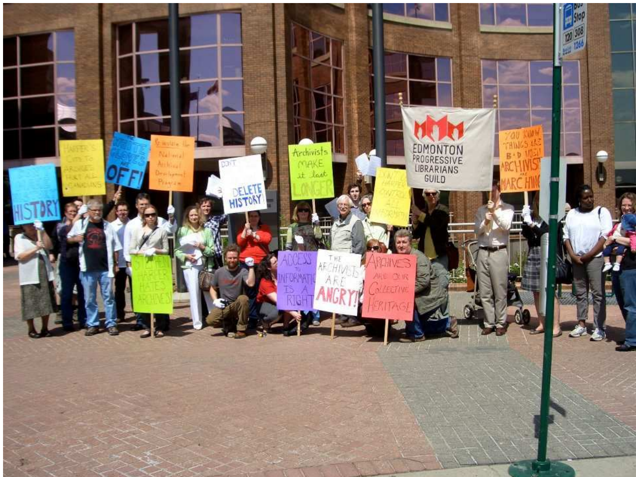
Archivists and allies, including members of the Edmonton PLG, participate in a protest against archival funding cuts on May 28 in Edmonton.